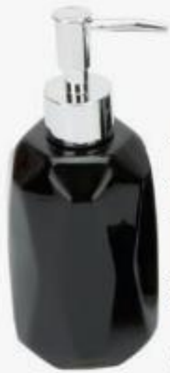
Soap dispenser, Home Box