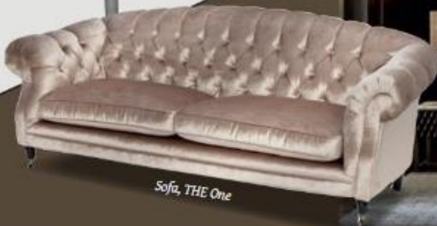
Sofa, THE ONE