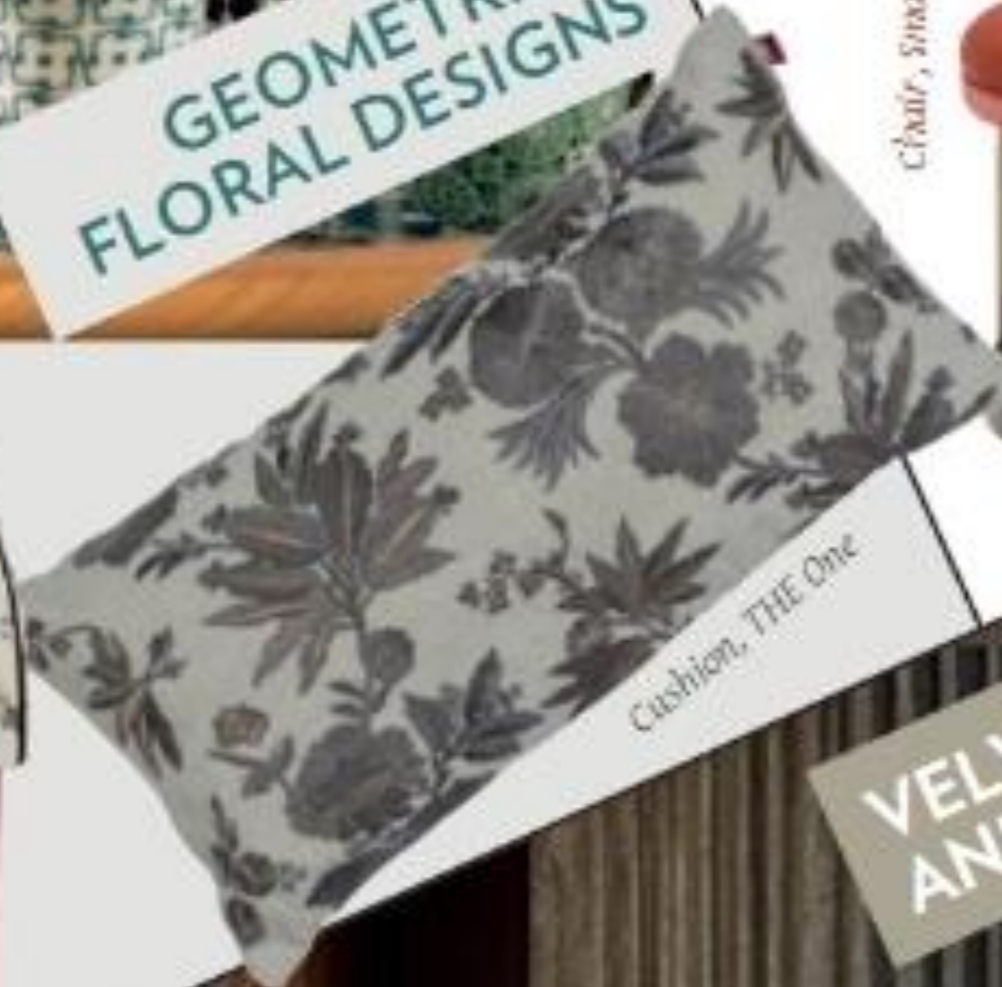
Cushion, THE ONE