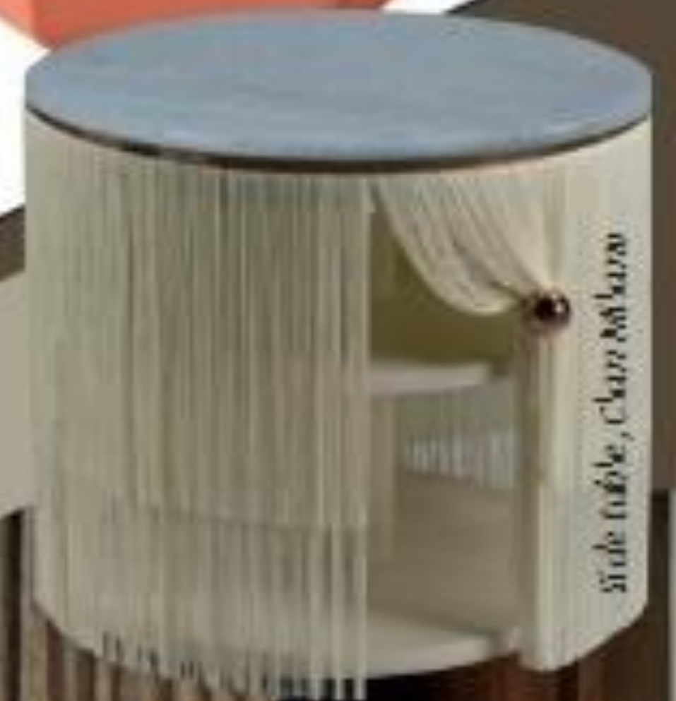
Side table, Chair & Table