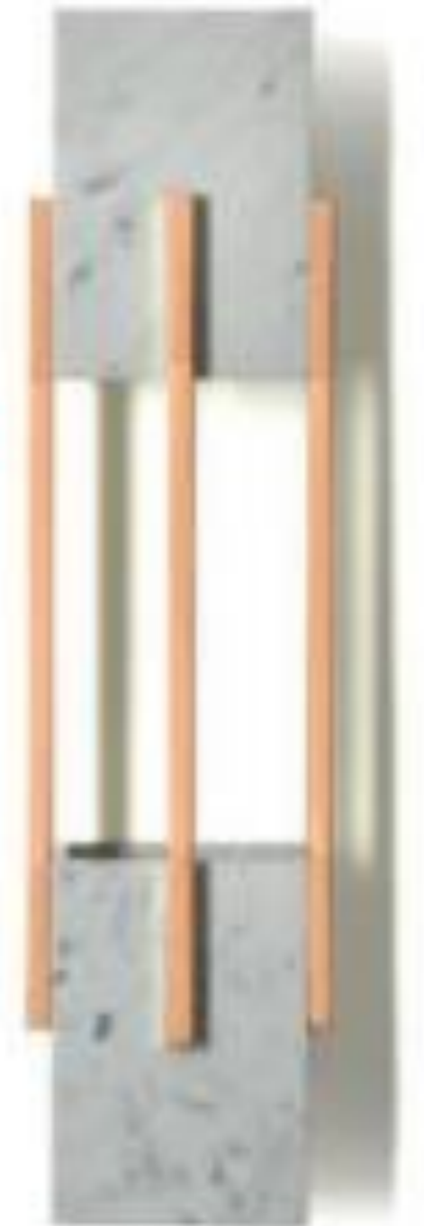
Lamp, THE ONE