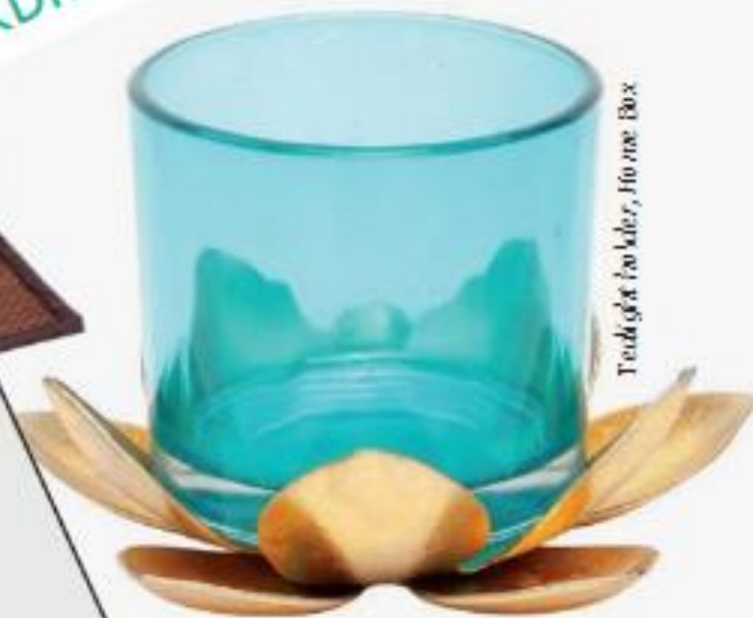
Tumbler, Home Box