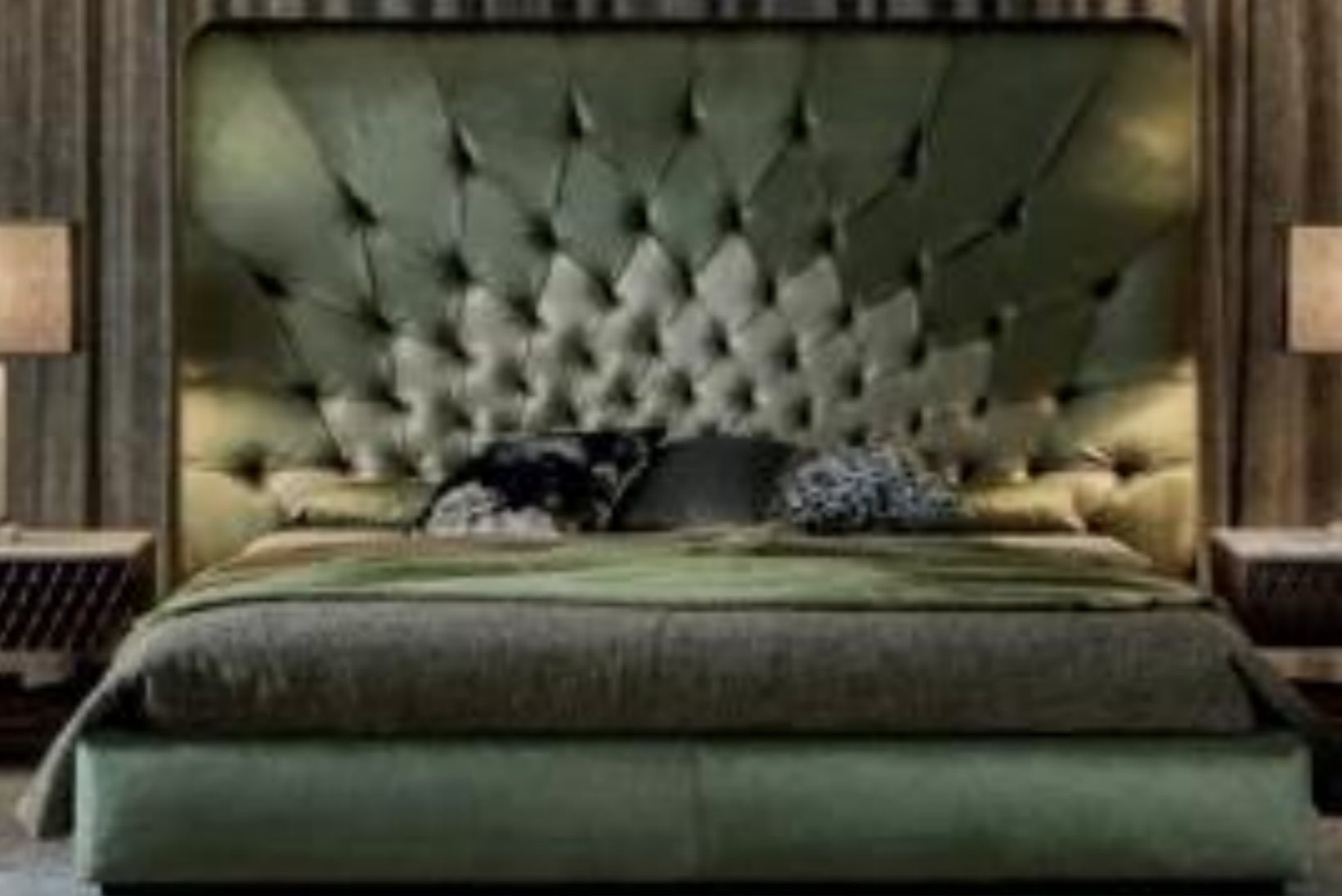
Bed, Opera Contemporary