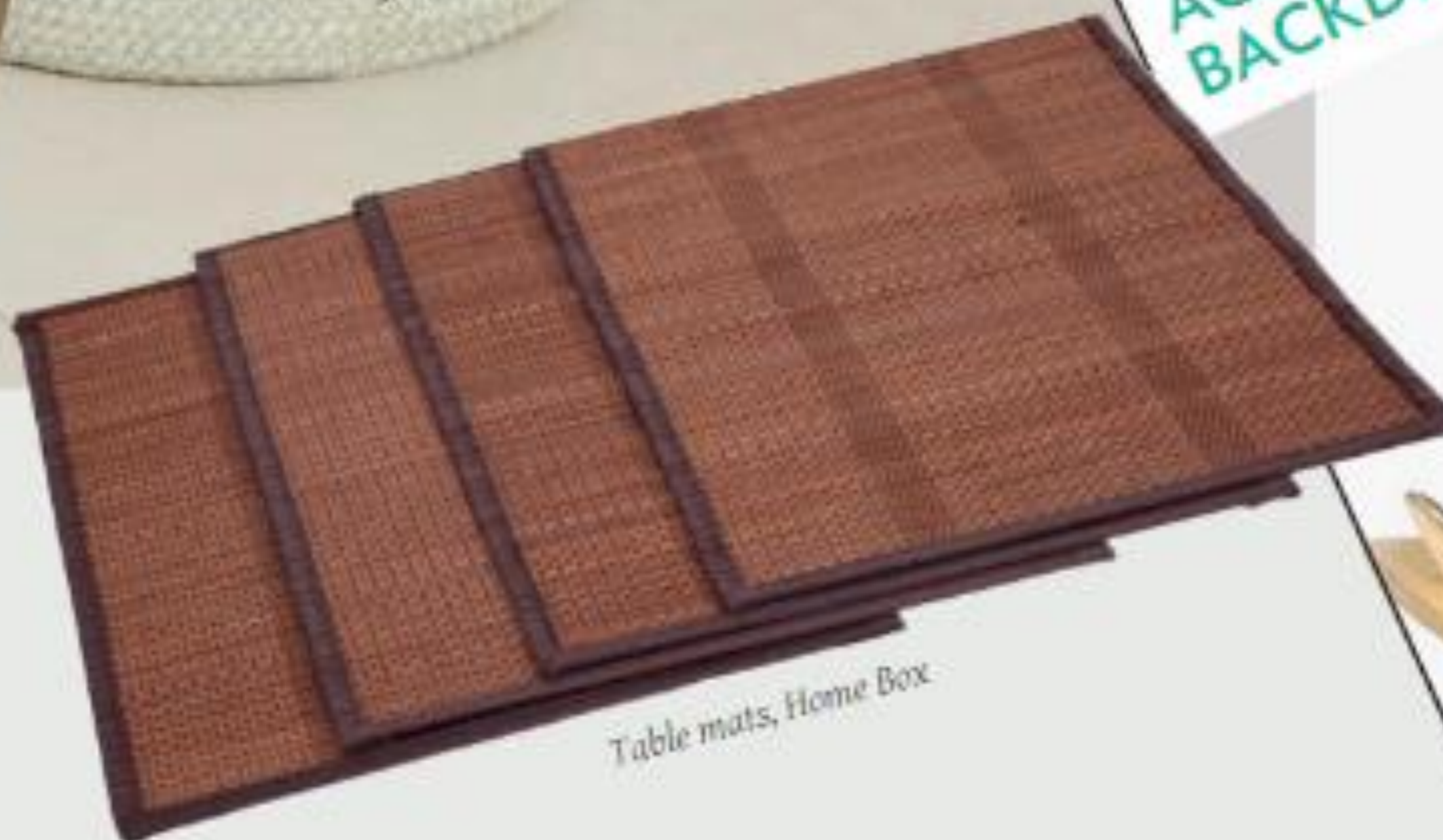
Table mats, Home Box