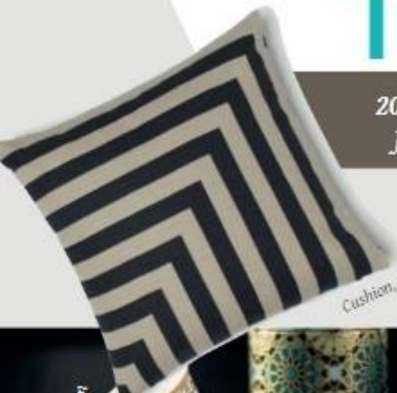
Cushion, H&M Home

2019 has brought along distinct styles for your living spaces. Just follow our pointers to live in a fashion-forward home.