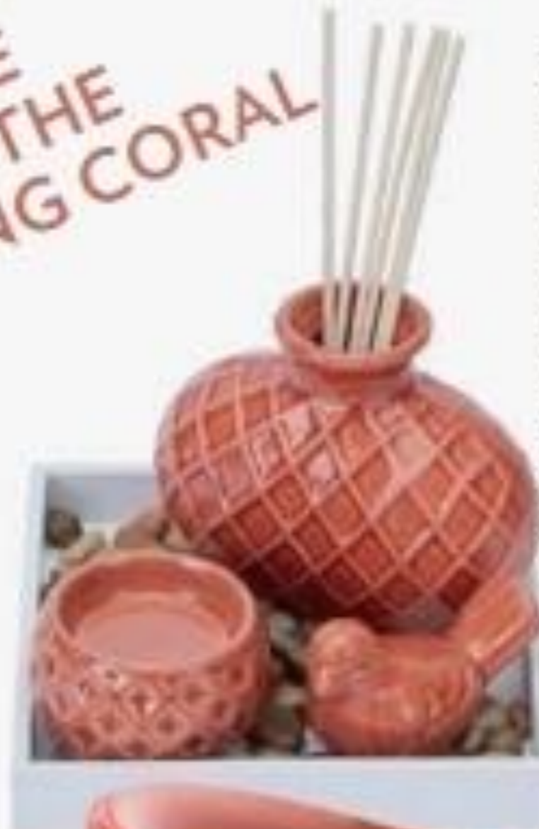
Fragrance accessories, Home Box

THE PANTONE COLOUR OF THE YEAR - LIVING CORAL