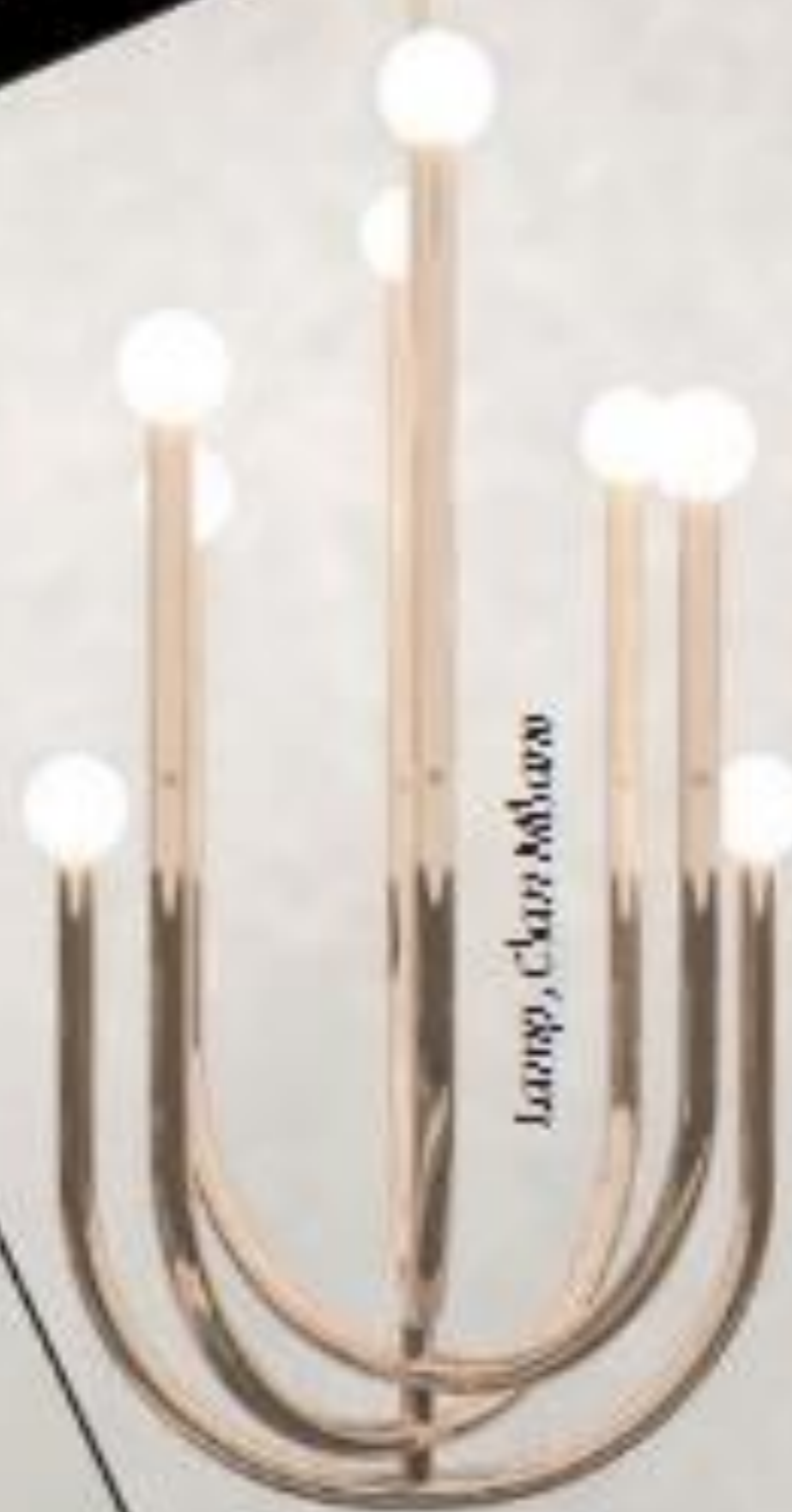
Lamp, Clear Bohem