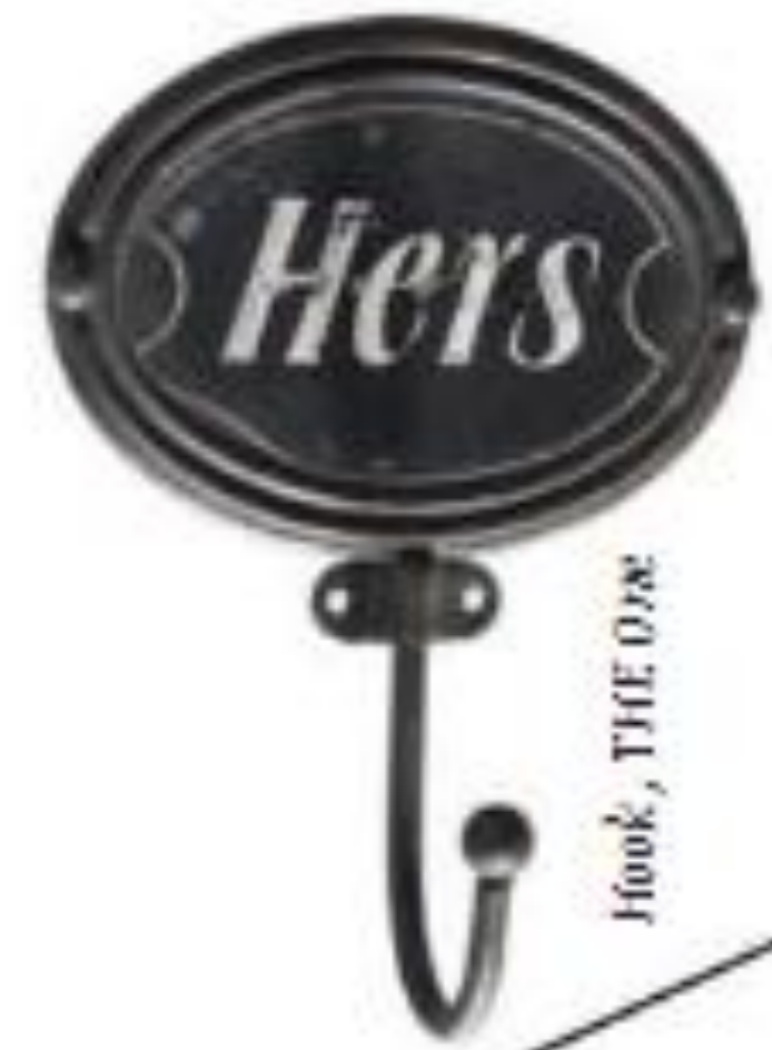
Hook, THE ONE