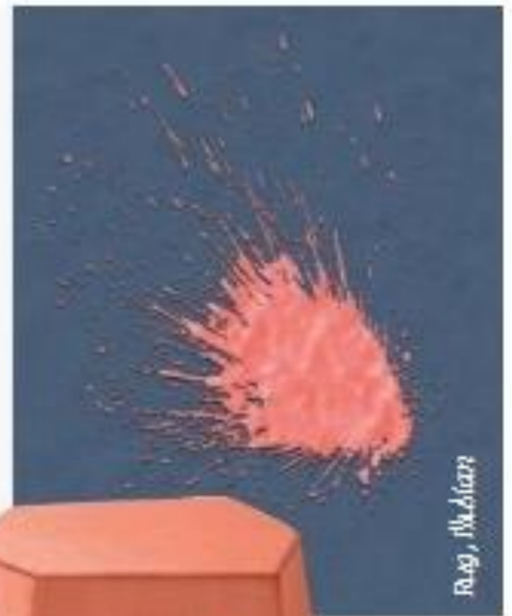
Rug, H&M Home