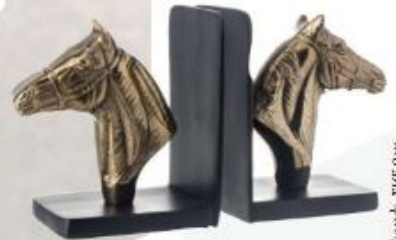
Bookends, THE ONE